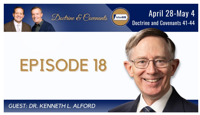
"My Law to Govern My Church"